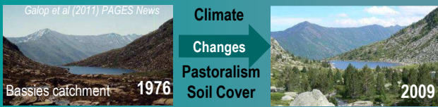
Results of OHM « Pyrenees Haut-Videssos (INEE-CNRS)