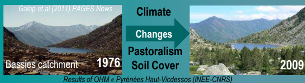
Results of OHM « Pyrenees Haut-Videssos (INEE-CNRS)