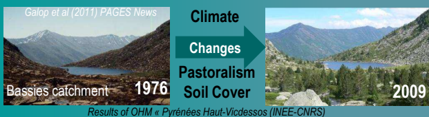
Results of OHM « Pyrenees Haut-Videssos (INEE-CNRS)